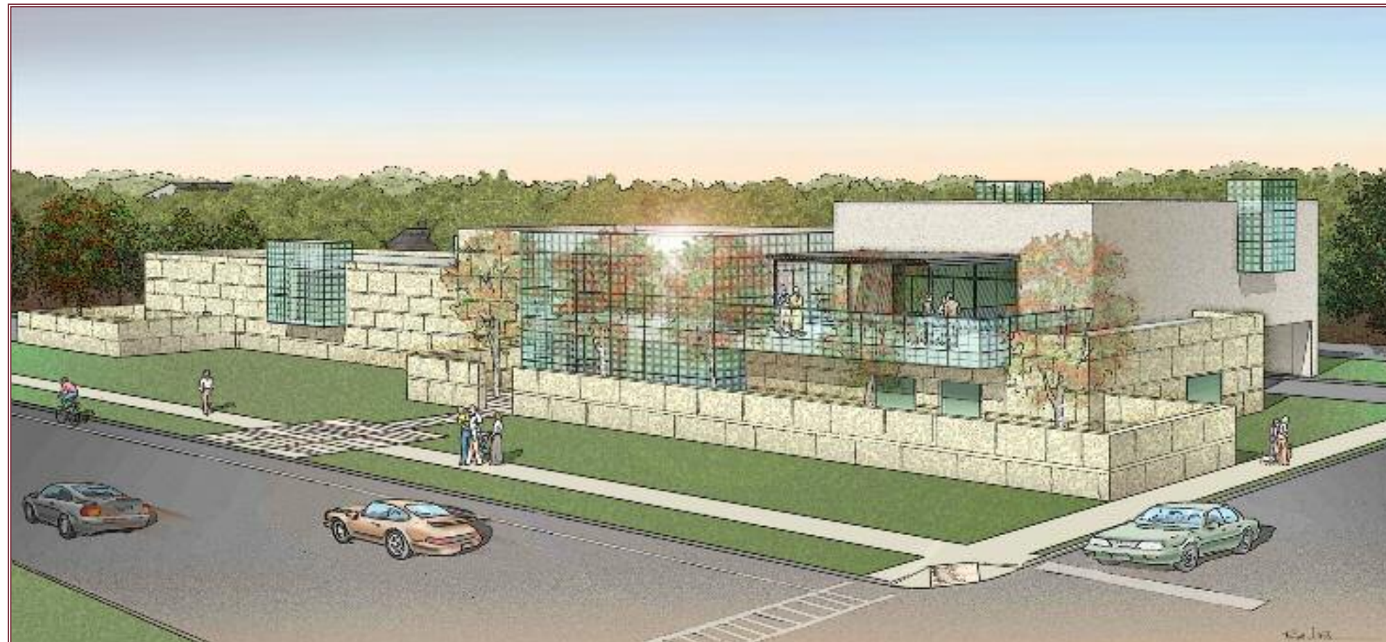
Architect's Preliminary Rendering